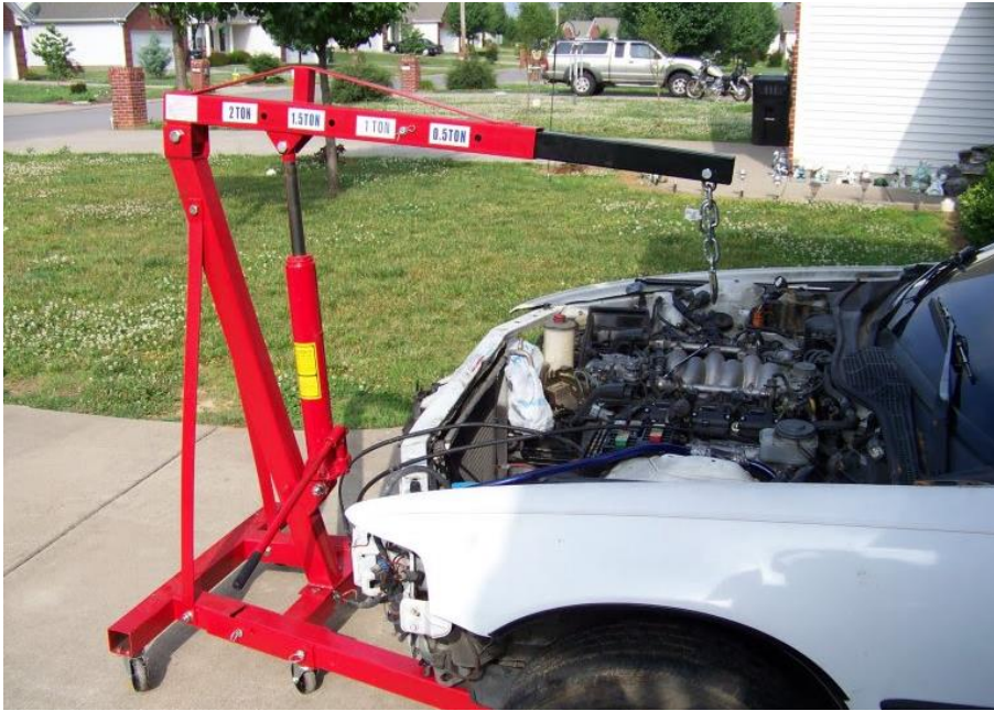
Crick Jack (manual crane for lifting vehicle engine or gearbox) item 14

Name of Bidder: _____ Designation: _____